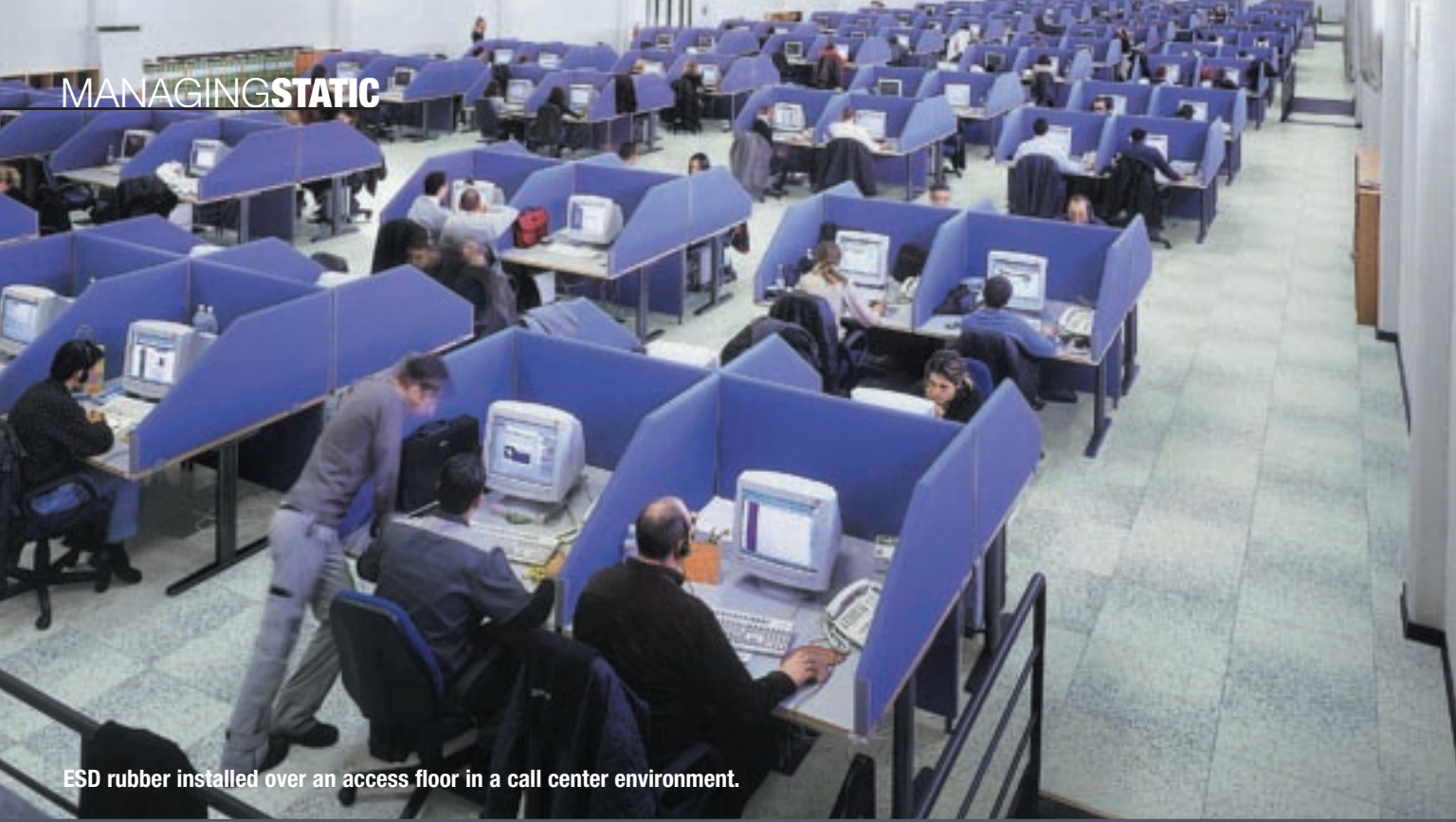
ESD rubber installed over an access floor in a call center environment.

grounded and will not reduce charges below the threshold of damage to the mission critical equipment it was intended to protect? That type of floor could provide false security and contribute to the very problem it is supposed to eliminate.